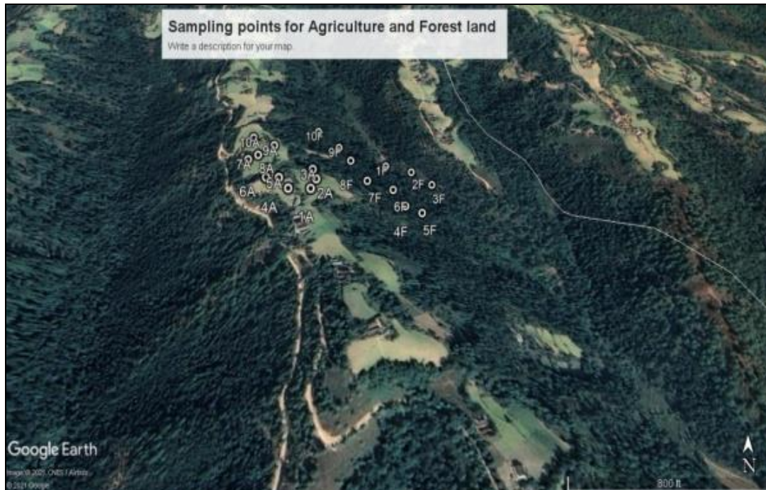
Fig 2: Sampling points for different land use